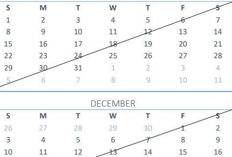
Instruction ends same week as UIUC

Instruction starts one week ahead of UIUC